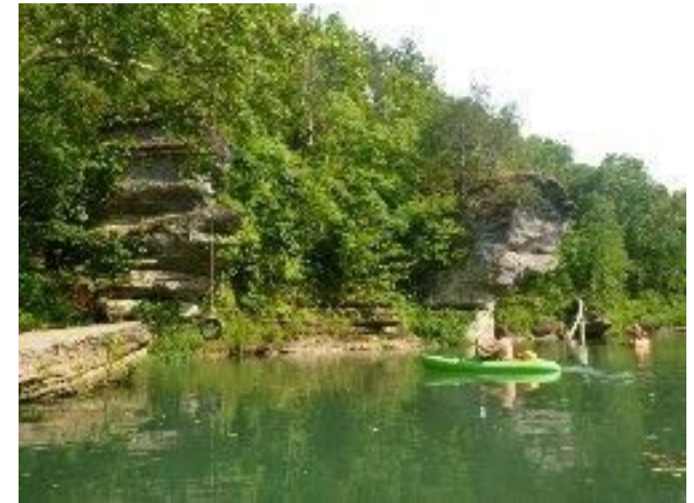
Beautiful Picturesque Piney River Canoeing, Kayaking, & Camping